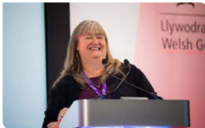
Julie James MS, Minister for Housing and Local Government

The Talent and Succession team delivered the 2nd All Wales Public Service Leaders' Summit in October, at the Liberty Stadium, Swansea.