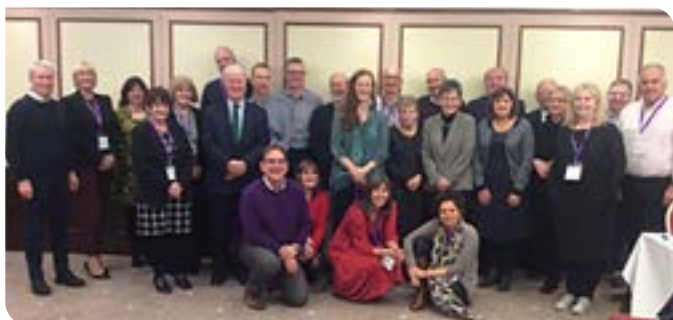
1st Cohort of IMs and Programme Facilitators