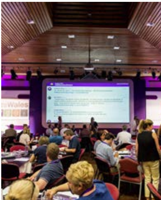
Delegates at Summer School

Our programmes and workshops are tailored to current and aspiring leaders and managers at three levels: