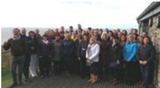
Delegates at Winter School

We continuously challenge ourselves to strive for higher delivery standards, put values into action, improve behaviours, have greater impact, increase effectiveness and meaningfully collaborate.