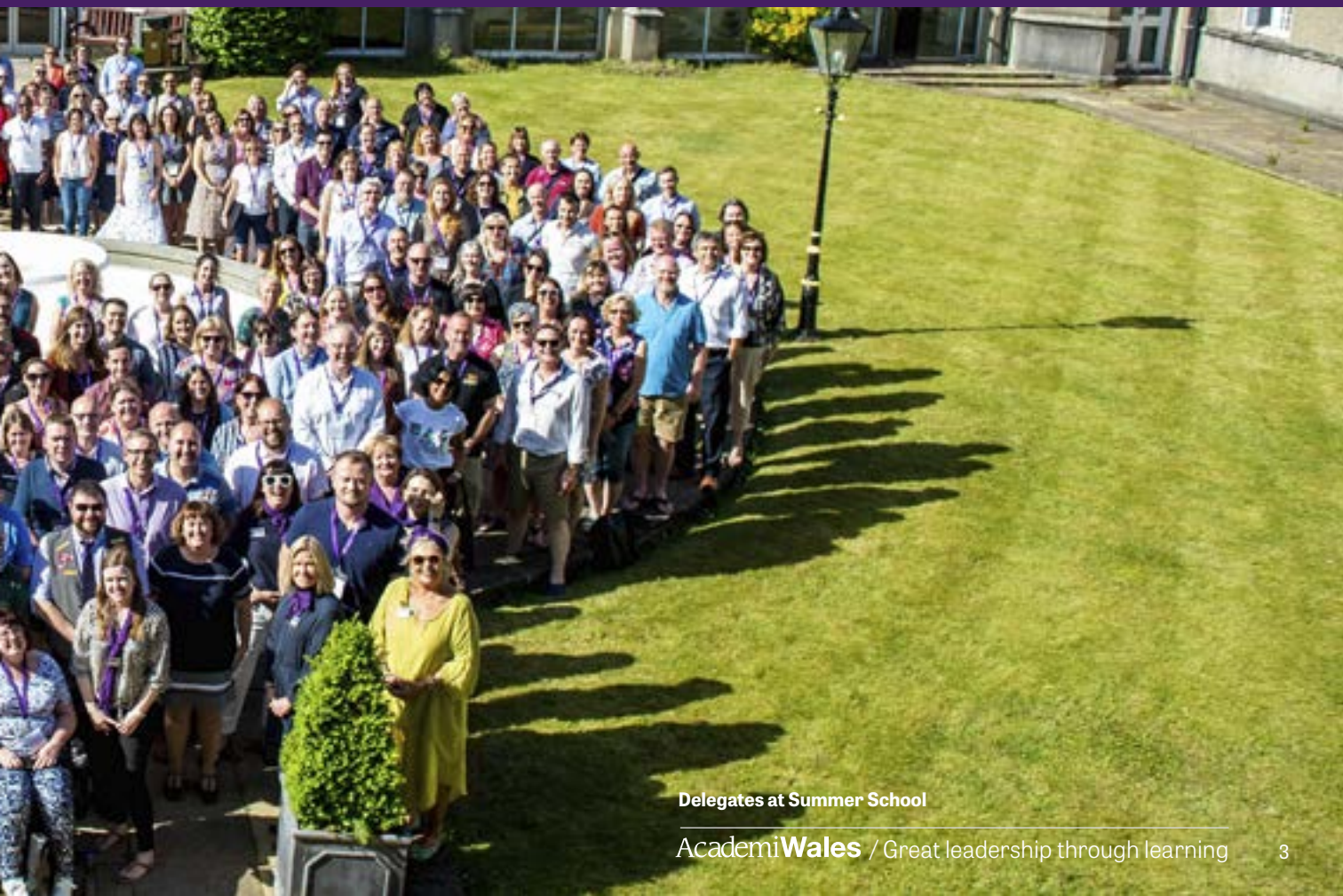
Delegates at Summer School

We believe that leaders who make the time to adopt a positive approach to their own learning are happier, live their values, understand their personal purpose and achieve greater personal and professional success.