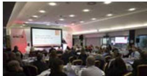
Delegates at the All Wales Public Service Leaders' Summit