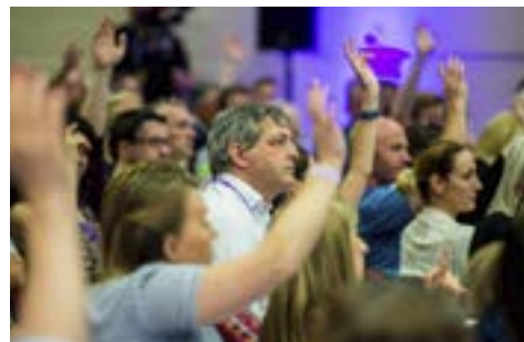
Delegates at Summer School